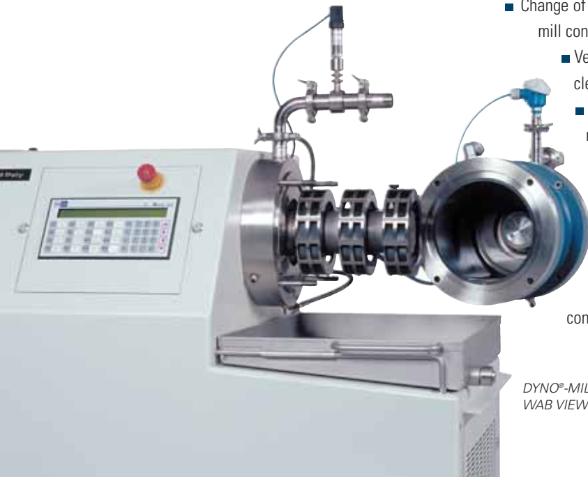
DYNO®-MILL ECM Poly with the modern WAB VIEW process control system

The unique high-efficiency agitator bead mill – the DYNO®-MILL ECM – is used for the continuous dispersion and wet fine grinding of pumpable products with low to high viscosity in the micron and nano range . The DYNO®-MILL ECM provides excellent performance for very high throughputs in a circulation process but also in a passage operation.