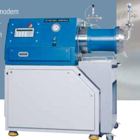
DYNO®-MILL ECM Plus